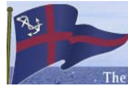
SOUTH COAST CORINTHIAN YACHT CLUB