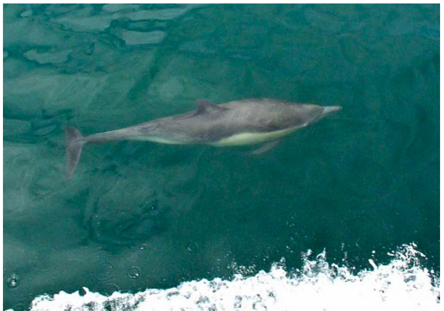
Tom Greene snapped this this photo of a dolphin gliding along in Osprey's wake.