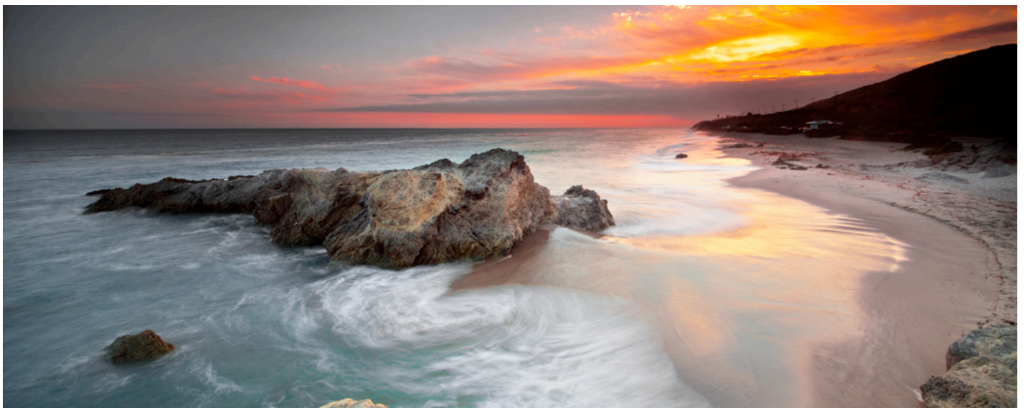
A Malibu sunset