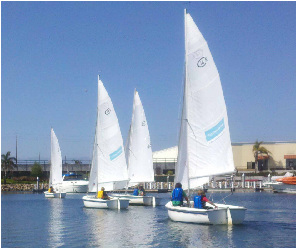
Members of the Oxnard Boys & Girls polish their sailing skills in the Fairwinds-sponsored summer program.