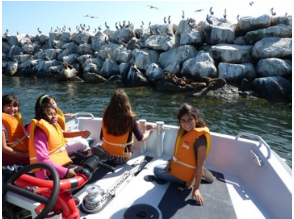
Admiring the seal lions, the pelicans and taking in that smell.