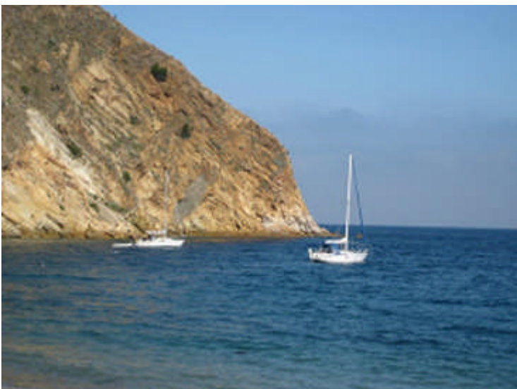
Island Side and Mark III at Goat Harbor.

Three Fairwind sailboats (Island Side, Mark III, and Seawing) set off on Friday, June 13, for a cruise to Catalina Island. We departed mid-morning under light to moderate wind conditions and were able to sail most of the way. Island Side and Mark III arrived around 4:30 PM and anchored at Goat Harbor. We joined the