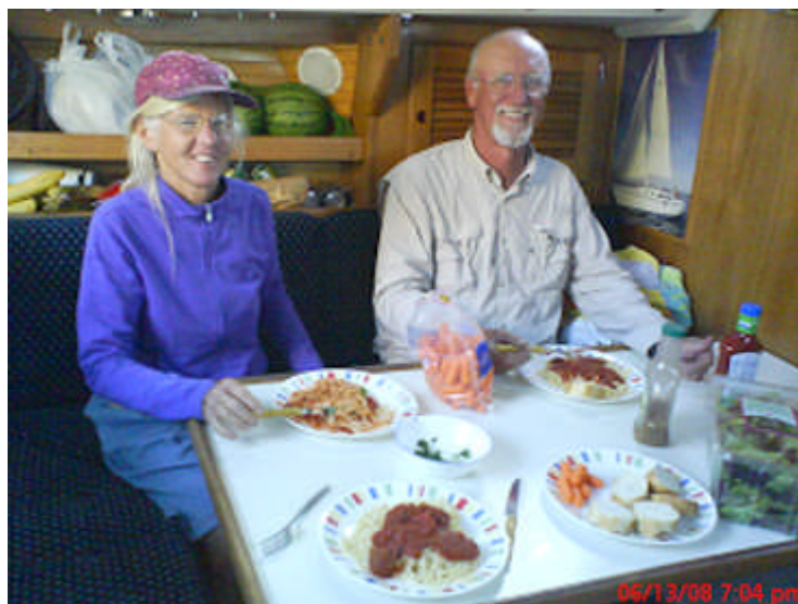
Enjoying a fine gourmet spaghetti dinner on board Mark III.