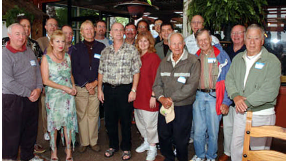
Boat Chiefs and Crew.