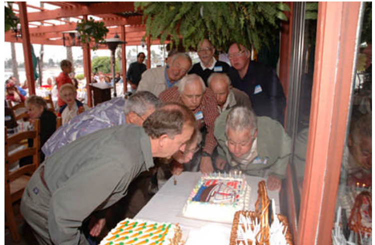
Our founding members blow out the candles on our 40 th anniversary cake.