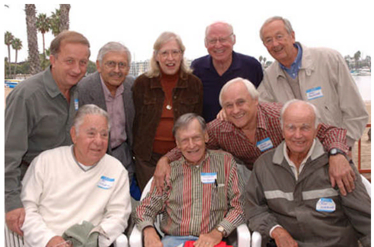
Founding members: Our Good Old Salts.