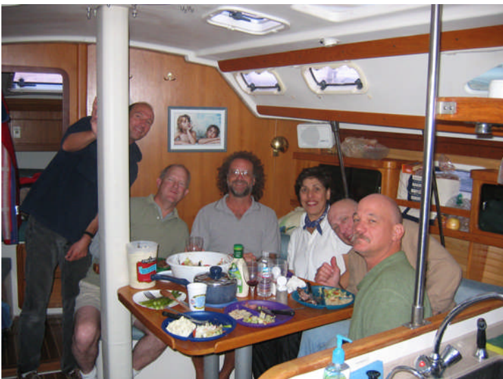
Dinner on Angelsea.

After the anchor was set, bearings were recorded to ensure that we would stay in one place. The anchorage was comfortable but the wind continued to howl through the night.