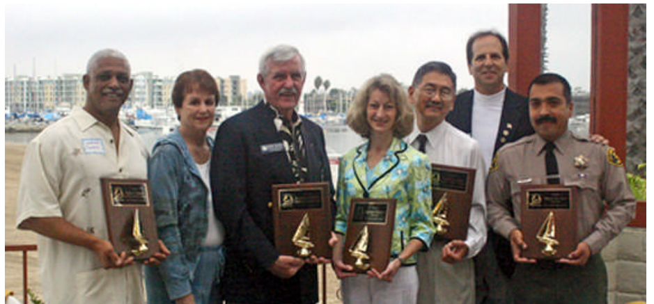
We really appreciate their help!!!