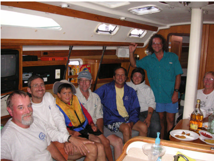
Party aboard Angelsea —prt

On arrival, Paradise cove was quiet, with only a dozen boats at anchor. There was some kelp (an early concern