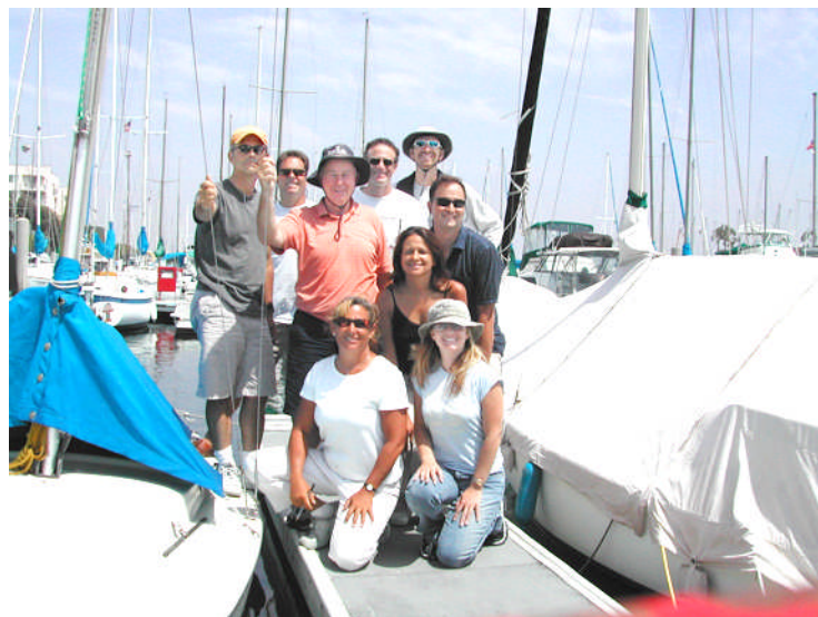
ASA 101 Challenge Group.