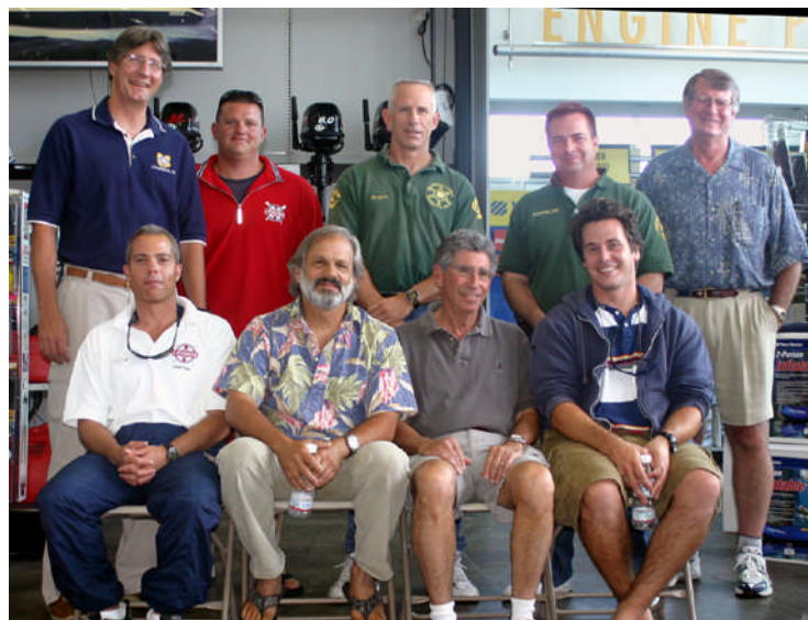
Safety Experts at Seminar: