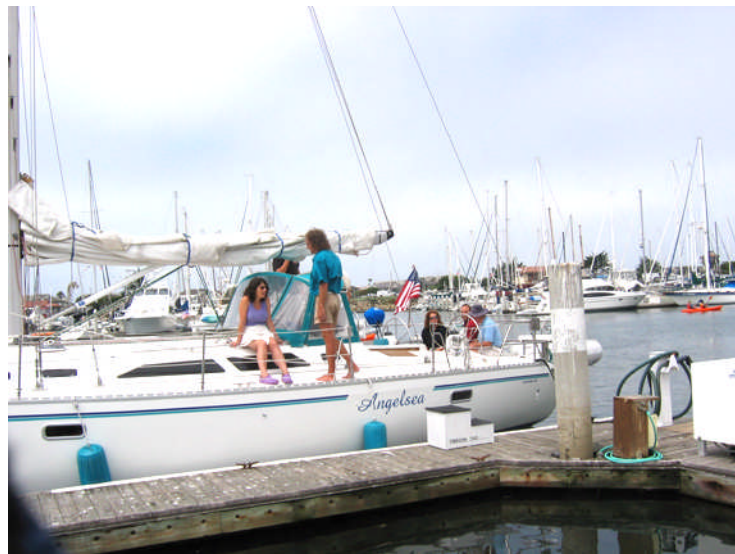
FYC's first Open House for the new Oxnard Chapter. FYC members and prospective Oxnard members boarding the latest addition to the Fairwind fleet, "AngelSea," a Catalina 400.

Fairwind will hold an Open House/Work day at the public docks at Peninsula Park (next to Hotel Sierra) on the first Sunday each month (except when the Sunday