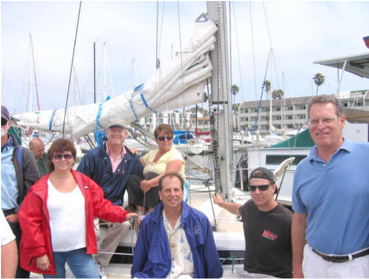
FYC's first Open House for the new Oxnard Chapter. Preparing to leave the dock is the "Freedom Too."

is on the first – the event will usually be the day after the MdR work day/open house). A BBQ at the park will be planned each month. A recruiting drive for Oxnard will begin shortly. The next event will be on Sunday, September 4 on Labor Day weekend.