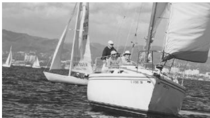
Concentration!!