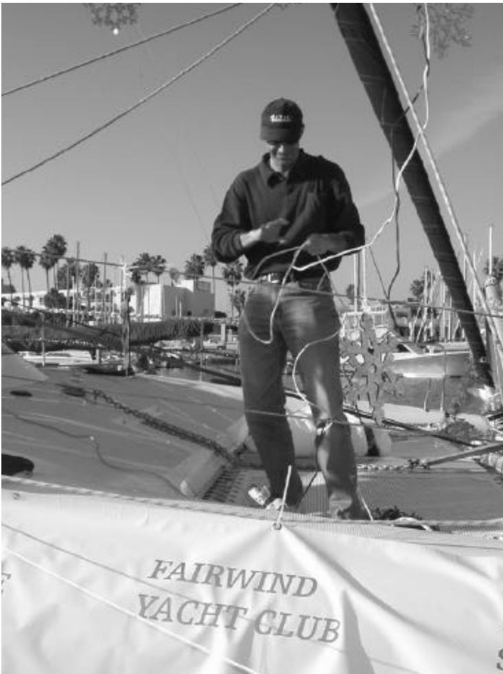
And what it took to get ready!!