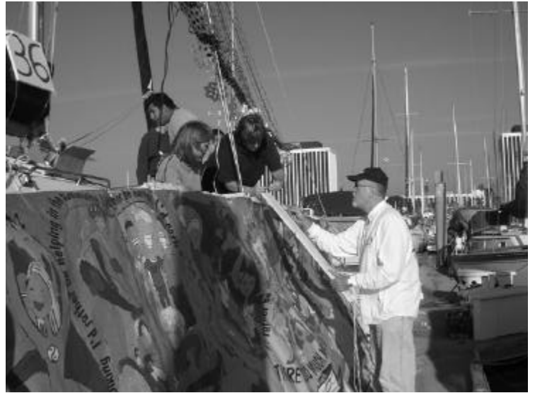
Work, work, and more work!!