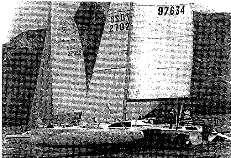
FYC's Sea Wing near Eagle Rock

The next 48 hours were spent BBQing, hanging out, attending seminars (the 'how to make rope shackles' clinic (they use no metal, are light, sturdy, inexpensive, and don't chafe or corrode) proved most popular. There were lots of hikes and even a nature 'treasure hunt'.