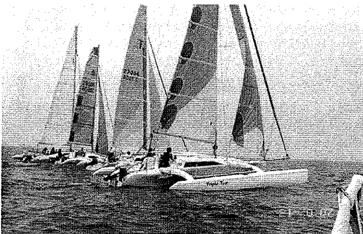
Triple Tap at the start.

The Fourth Annual Indian Summer Splash was a big success. 34 trimarans and catamarans competed in what's become the largest offshore multihull event on the West Coast and the second largest in the nation. The event was co-sponsored by Fairwind Yacht Club and Multi Marine. The start was on Friday, September 19 outside Marina del Rey to Cat Harbor on Catalina. We had a modest breeze and flat water that saw most boats finishing inside of four hours.