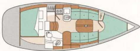
Two Cabin Layout